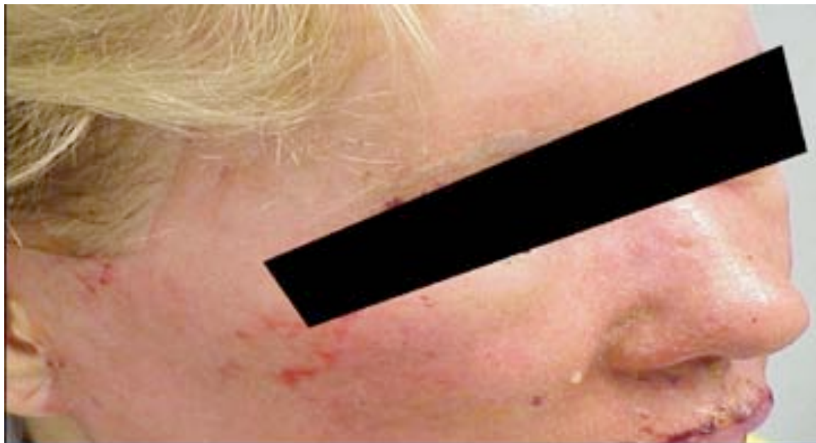
24 hr Post-Op Laser Resurfacing with PRP (Less pain, inflammation, swelling, redness & exudate)